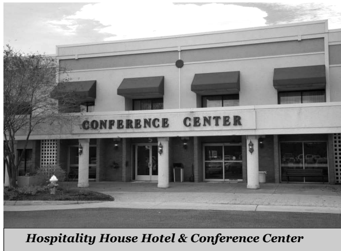
Hospitality House Hotel & Conference Center

The conference fee for members is $90 per person which includes all three meal events: Welcome Reception, Awards Banquet, and Sayonara Breakfast. The registration fee for non-members wishing to attend is $100. If you are a member and can only come to the banquet, the fee is $50. Non-members wishing to attend the banquet only: $60. Note: If you