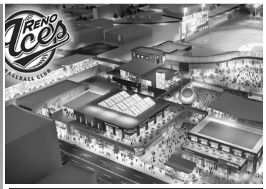
The Reno Aces, the triple A rated farm team of the Arizona Diamond Backs will be playing in their ultra-modern complex within walking distance of the hotel.

A variety of water sport activities are available on the Truckee River which runs right through the city and very close to the Silver Legacy. Kayaking, white water rafting, boogie boards and tubing are but a few of the sports that will be in high season when the USMCCCA conference hits town. Bring your bathing suits!