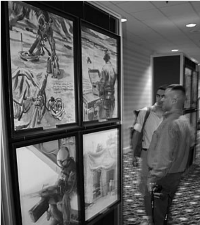
Conference Highlight were the tremendous display panels provided by the Museum of the Marine Corps. Each panel depicted a display being featured at the popular Quantico Museum.